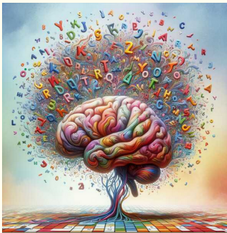
Puzzles From the Dump